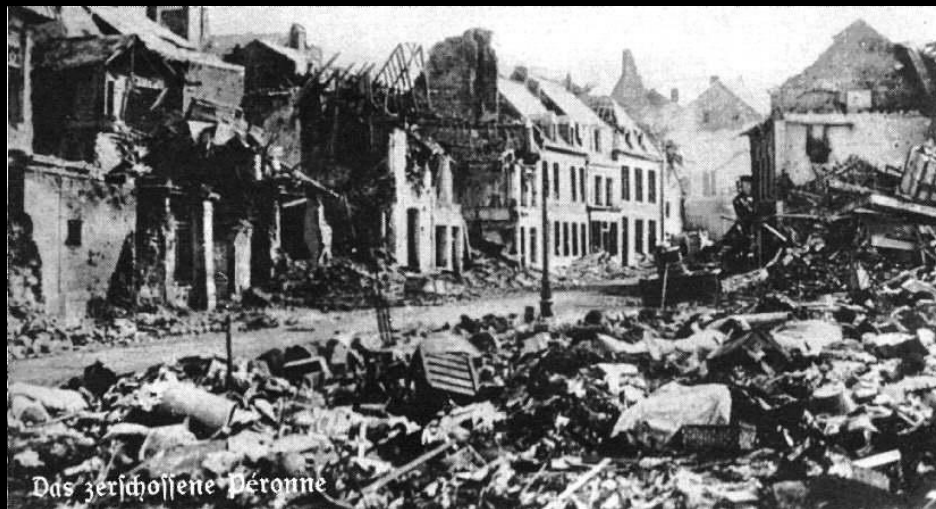
Das zerstörte Peronne